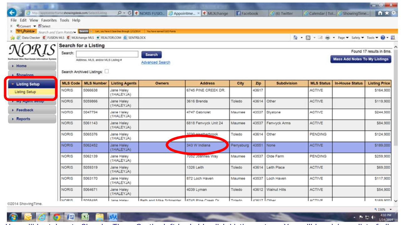
You will be taken to ShowingTime. On the left had side click Listing set up. You will be giving a list of all your listings. Select the property you would like to edit by clicking on the address.